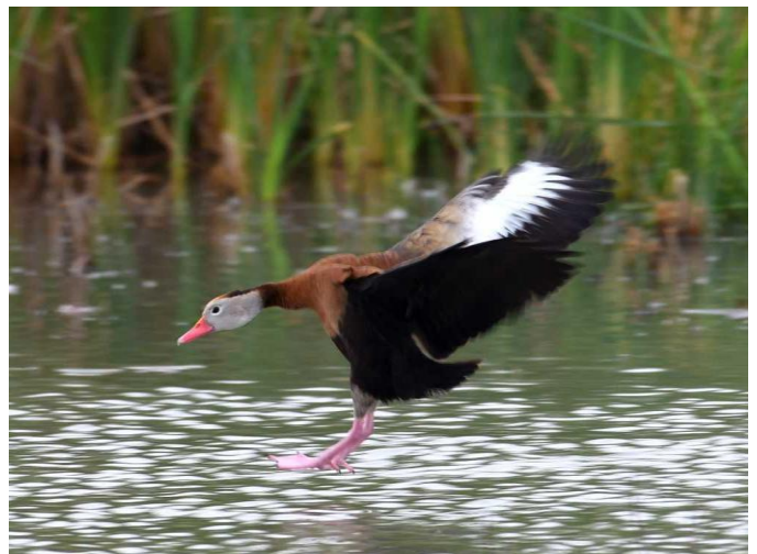
A Black-bellied Whistling Duck makes a two-point landing on the main pond at Estero Llano Grande State Park.

The RGV is a great place to see birds found only in that area of the U.S. Besides birds, you can see alligators, javelinas, lizards, and snakes, like the Texas Indigo Snake that we (not Cheryl!) saw at Santa Ana Wildlife Refuge. And, if you're into insects, you'll find plenty of butterflies and one of my favorites, the Leafcutter ants. The area is like Disneyland for birders and nature lovers!