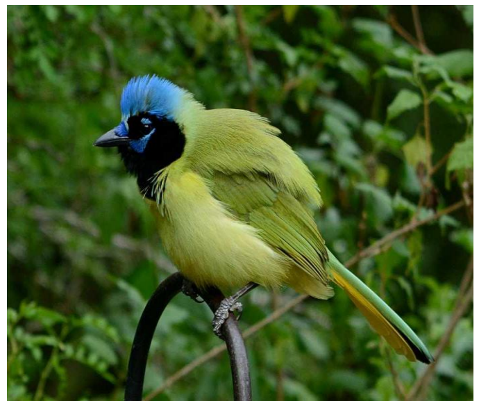
A Green Jay bristles on a feeder pole at Bentsen-Rio Grande Valley State Park.

We stopped by a hawk watch at Bentsen-Rio Grande Valley State Park. We missed the hawks that had been spotted earlier from the viewing platform, but Turkey and Black Vultures circled steadily overhead. At one of the feeding stations, groups of Green Jays showed off their bright colors. Nearby, large turkeys strutted and fanned their tails to attract females.