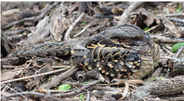
A Common Pauraque hides in plain sight at Estero Llano Grande State Park.

In the first section, Alligator Pond is true to its name. A large female sunned on the shore, while several of her babies were visible near the edge of the pond. Near that pond, an Eastern Screech Owl poked its head out of an owl box, and, with help from a park ranger, we spotted a Common Pauraque almost completely camouflaged just off the trail.