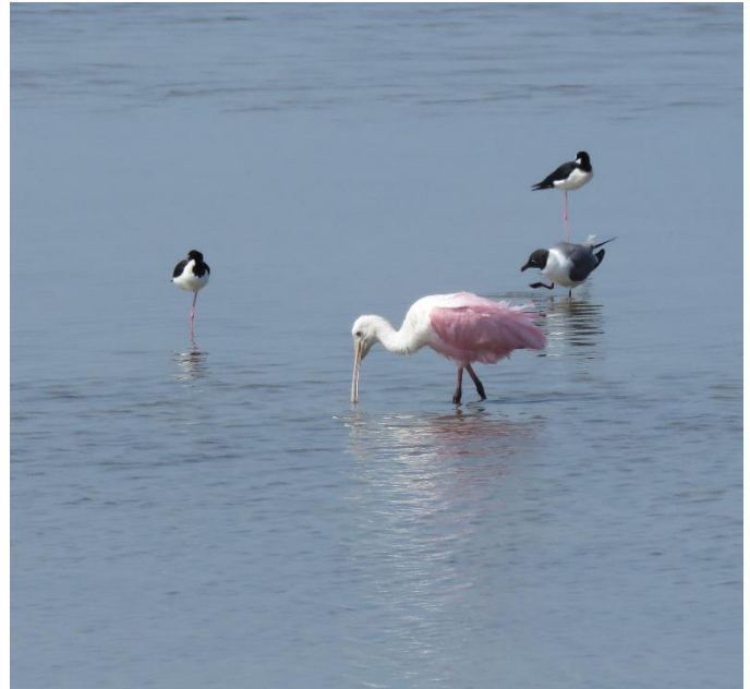
A Roseate Spoonbill mixes with a Laughing Gull and two Black-necked Stilts at the South Padre Island Birding and Nature Center.